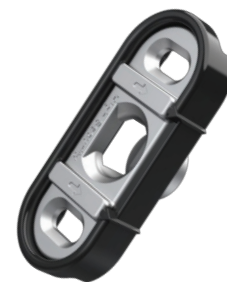
Profile Specific Packer