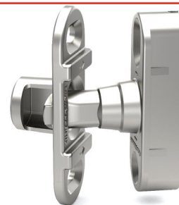
Bolt and Keep